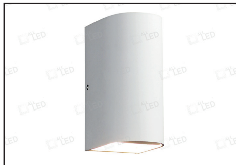
Polar White AWL10WH/CCT