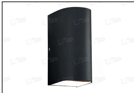
Carbon Black AWL10BK/CCT