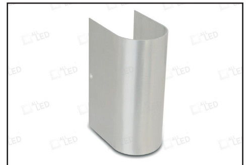
Aluminium Accessory* AWL10/AL/ACC